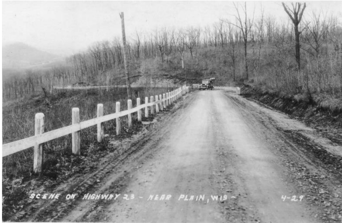
Does this road look familiar? Highway 23 near Plain in 1929.