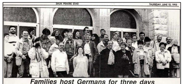
Families host Germans for three days

June 1993 Plain: The first visit of people from Waldmünchen occurred in 1993 when 37 Bavarians made a three-day visit to Plain as part of a broader tour of America. They stayed in the homes of families in Plain, toured St. Luke Catholic Church, the old St. Luke Cemetery where many Bavarian immigrants are buried, and St. Anne Shrine. The group enjoyed a potluck lunch with around 150 citizens from around the Plain area.