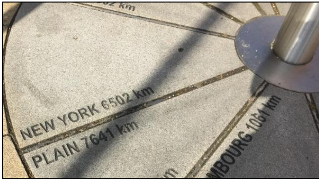
Marker in Waldmünchen shows the distance to Plain as 7641 kilometers

Since at least 1929, there have been visits of individuals from the Plain area to the Oberpfalz region of Bavaria to meet relatives, search for roots, or engage in social and cultural visits. Similarly, individuals from the Waldmünchen area have visited in Plain.